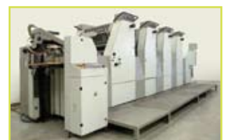
Four colour process press