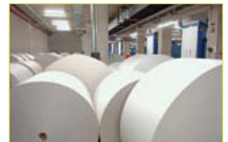
Web printing paper rolls

Web printing is used for very high volume work, such as newspapers and magazines. They are large, fast machines fed by large rolls of paper.